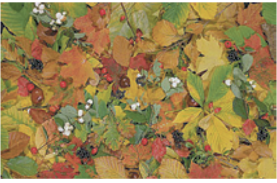
With Fall coming, cooler temperatures are just around the corner – wait a minute... it's been great riding weather all Summer!

For more information contact: Joyce Fogle, 336-7546 or studio@joycefogle.co m (new email)