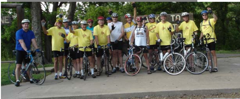
Group gathering for a recent Tuesday Ride at Johnstone Park

BARTLESVILLE PEDALERS BICYCLE CLUB P.O. Box 793, Bartlesville, Oklahoma 74005