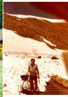
Walter in the Snow