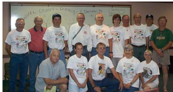
FreeWheel 2003 Countdown Group picture

Wear your new FreeWheel shirt and come for fun, refreshments, GROUP PHOTO, & goodie bags, guaranteed to help make your week of cycling across Oklahoma a favorite time to remember!