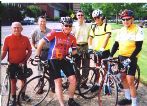
Group of pedalers at the Chamber of Commerce Ribbon Cutting picture.